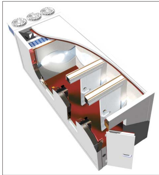
Figure 1. Sketch of the Uniers Cryo-Combi whole-body cryotherapy device (Oy MJG Uniers Ab, Helsinki, Finland) showing the 3 chambers.

Topical anti-inflammatory preparations (ie, corticosteroids or topical calcineurin inhibitors [TCIs]) or systemic antihistamines were not allowed for 1 week before or at any time during the study. The washout period for systemic therapy and phototherapy was 6 weeks. Whole-body cryotherapy was given 3 times a week for 4 weeks in Haikko Spa